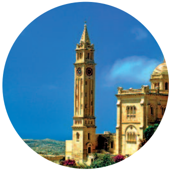
Ta' Pinu Church