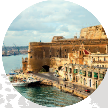
Valletta Grand Harbour